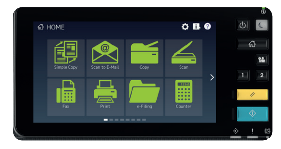
Customised to display icons as buttons

Customised to display up to 18 icons per page and with a different background